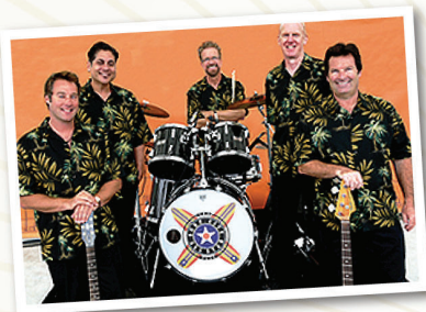
Surf City All Stars