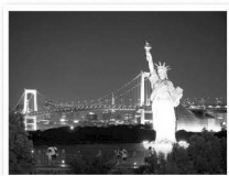
Trip to New York City