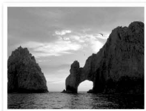
Trip to Cabo San Lucas, Mexico

Enter for a chance to win one of these fabulous prizes!