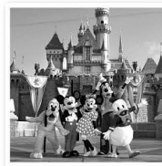
Tickets to Disneyland