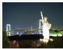
Trip to New York City