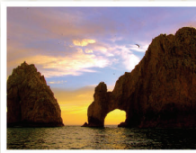
Trip to Cabo San Lucas, Mexico

Enter for a chance to win one of these fabulous prizes!