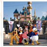
Tickets to Disneyland