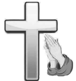
Pray for us