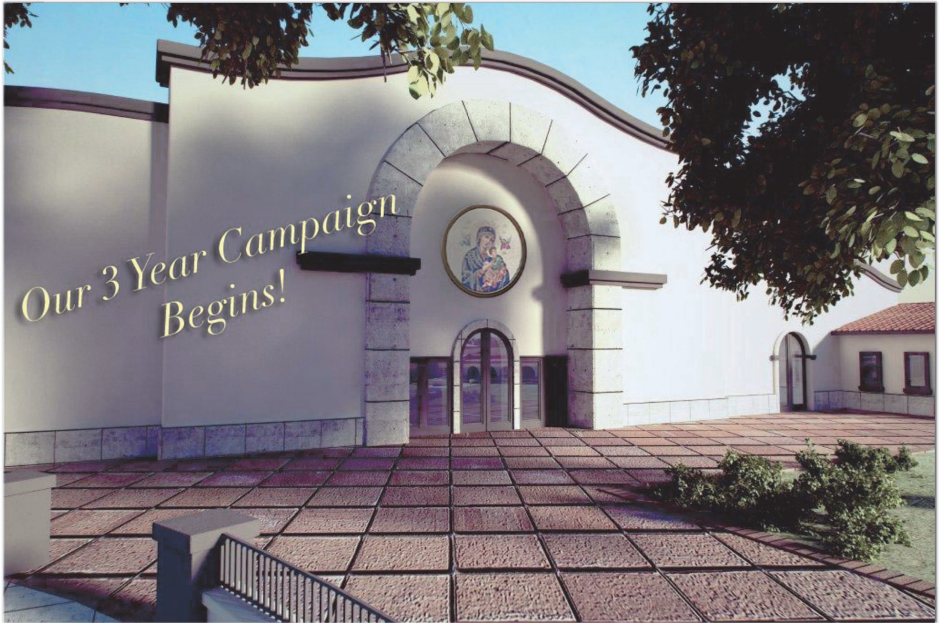
Proposed Fellowship Plaza & Main Door

PASTORAL CENTER - 23045 LYONS AVENUE, SANTA CLARITA, CA 91321-2632