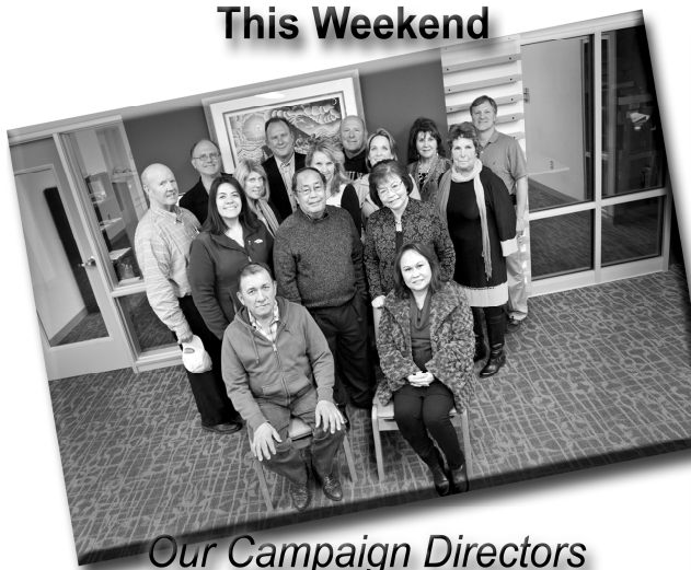
Our Campaign Directors